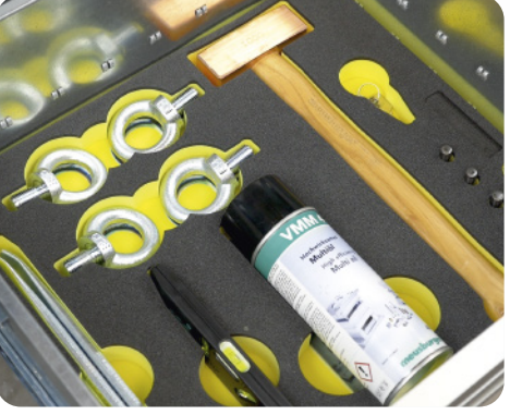
Included in delivery

Meusburger Georg GmbH & Co KG | Kesselstr. 42 | 6960 Wolfurt | Austria T +43 5574 6706-0 | sales@meusburger.com | www.meusburger.com